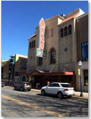
potential future grants and investment. <sup>69</sup> The designated area includes much of the west side of downtown that is also listed in the National Register of Historic Places,